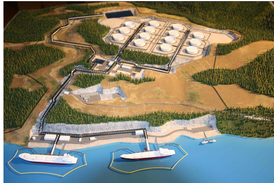
Kitimat marine terminal model