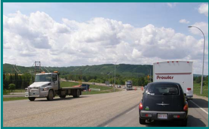
Reduced to one lane, traffic waits at Dunvegan Bridge over the Peace River in northwest Alberta